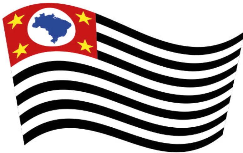
FLAG SÃO PAULO CITY